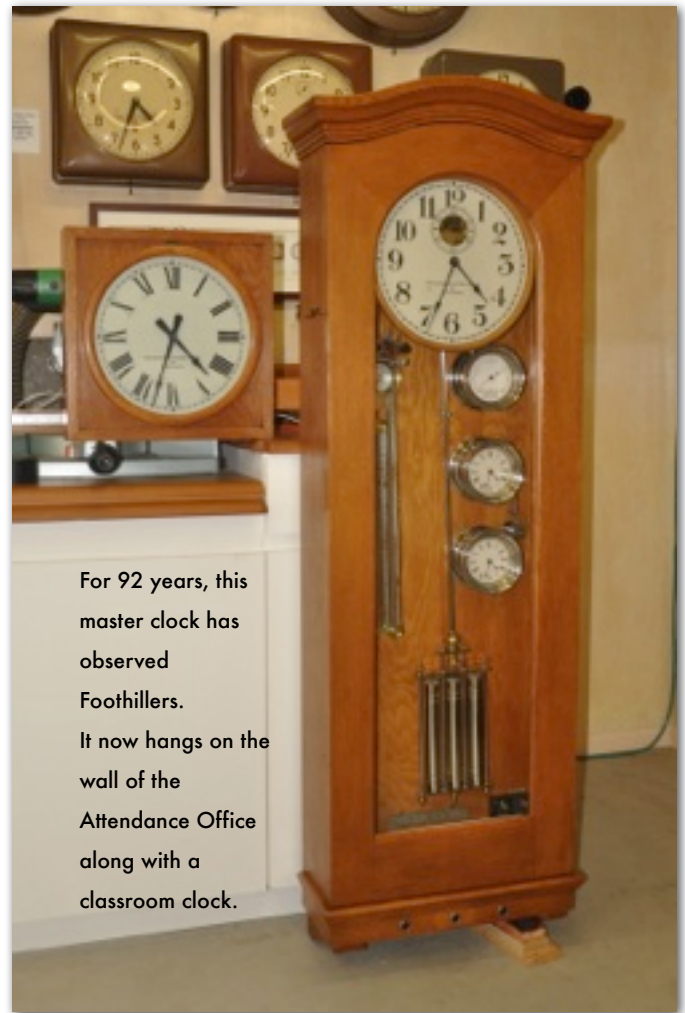
For 92 years, this master clock has observed Foothillers. It now hangs on the wall of the Attendance Office along with a classroom clock.

At http://grossmontalumni.net , our GHS Alumni website, you can register for free, search for class contacts and individual classmates and read the information about themselves they have shared, find reunion information, memorials to Foothillers We Have Lost , and more. Spend some time exploring YOUR website!